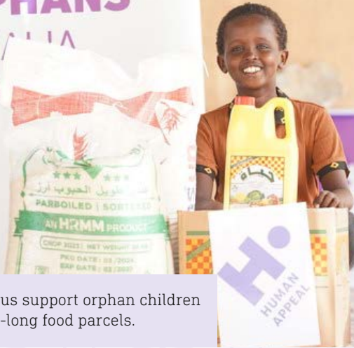
You helped us support orphan children with month-long food parcels.