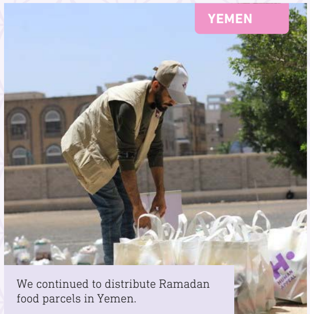
We continued to distribute Ramadan food parcels in Yemen.