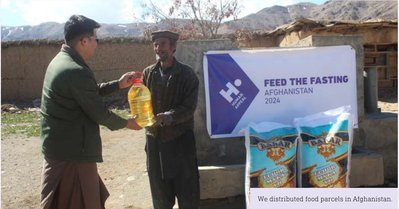
We distributed food parcels in Afghanistan.