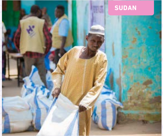
We provided 610 Ramadan food parcels in Sudan