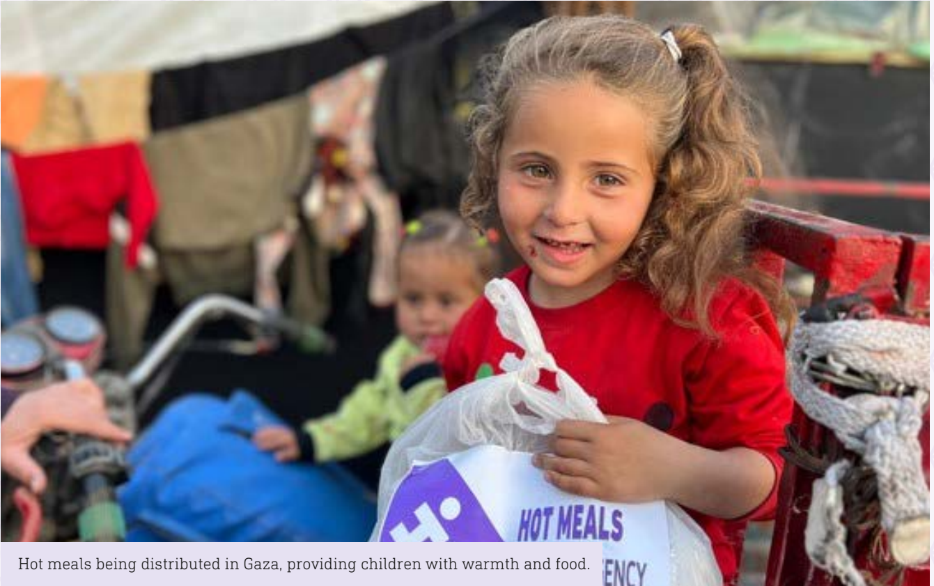
Hot meals being distributed in Gaza, providing children with warmth and food.