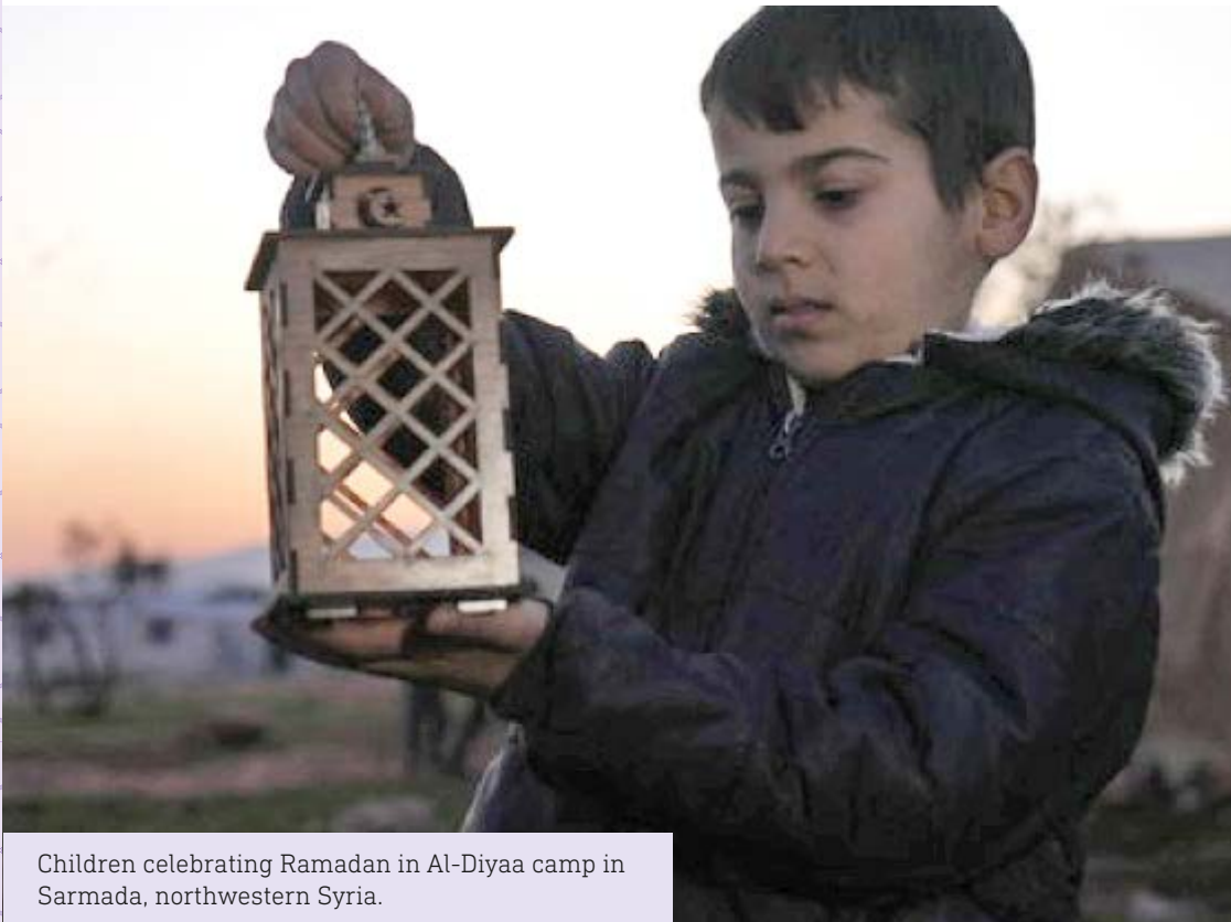
Children celebrating Ramadan in Al-Diyaa camp in Sarmada, northwestern Syria.

May Allah accept your duas and reward all your worship this Ramadan.