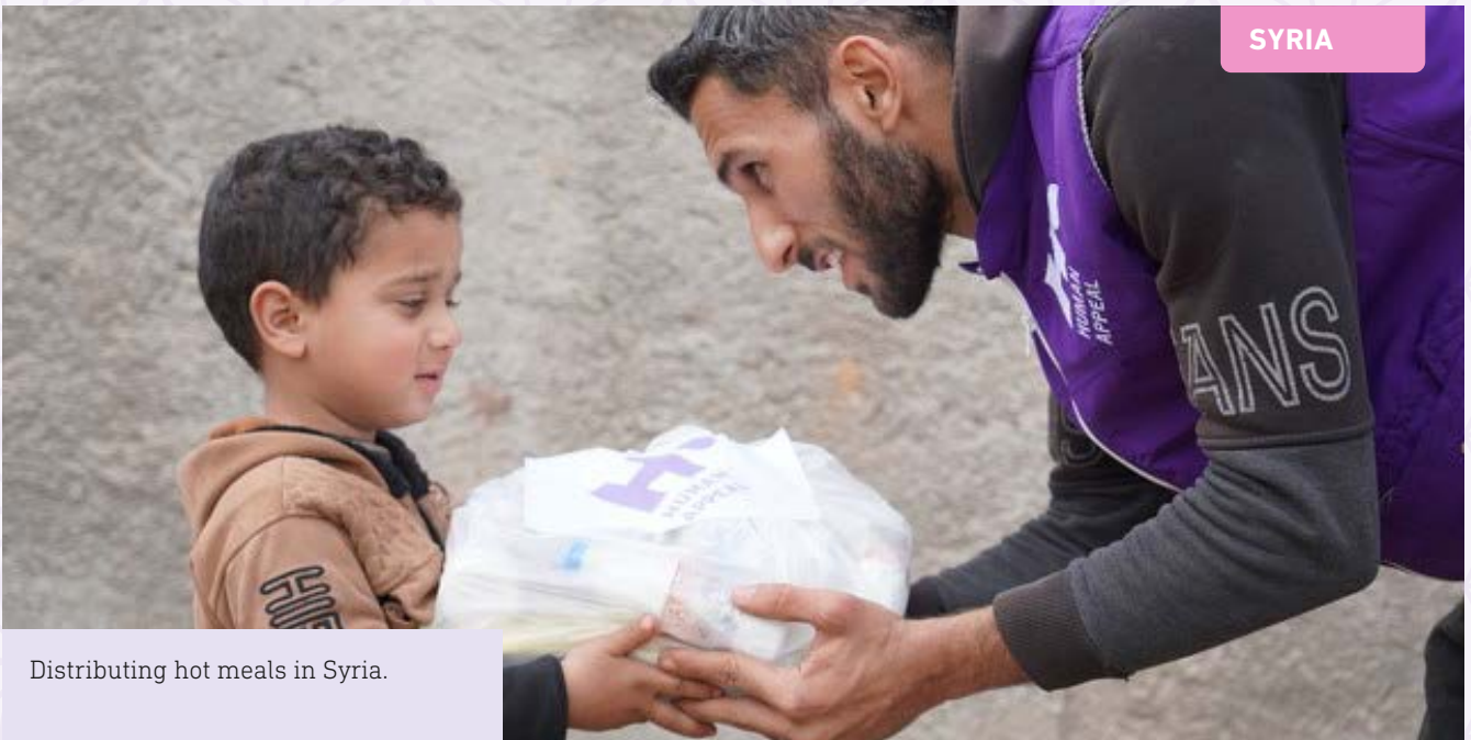
Distributing hot meals in Syria.