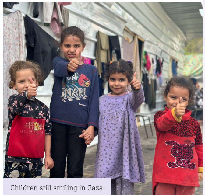
Children still smiling in Gaza.