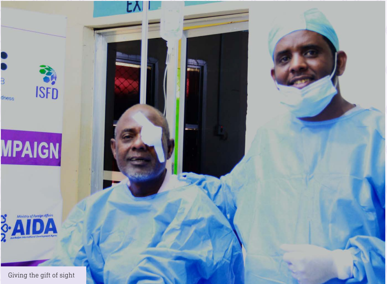
Giving the gift of sight