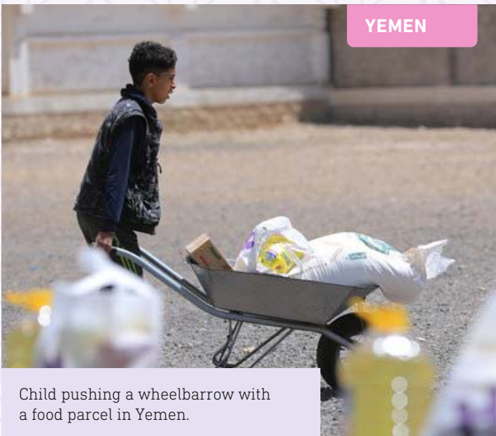
Child pushing a wheelbarrow with a food parcel in Yemen.