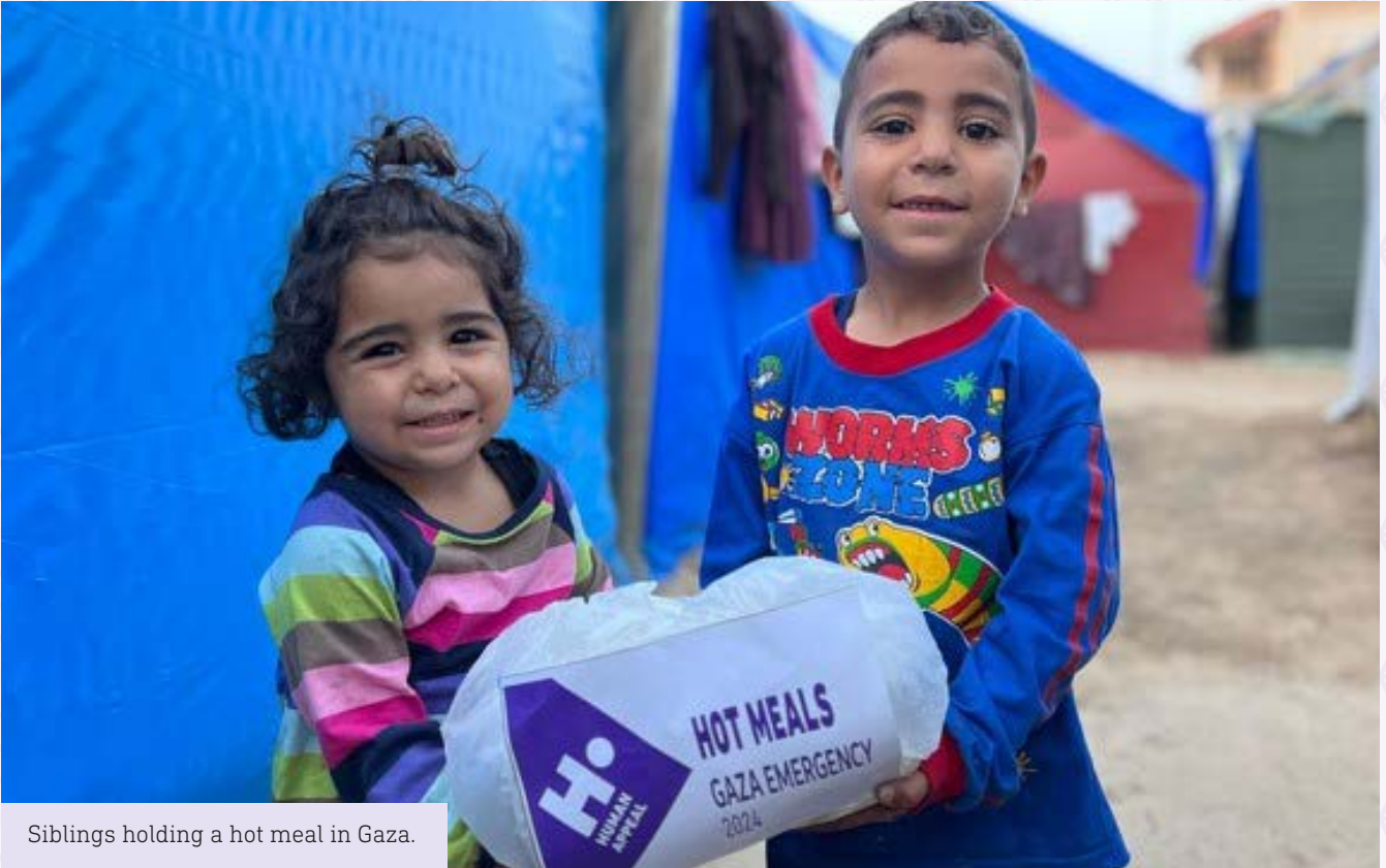
Siblings holding a hot meal in Gaza.

Gaza is currently experiencing various forms of death in different ways. Every family is at risk of death, whether from hunger, thirst, bombing, or suffocation under the rubble of their homes. I have witnessed many massacres around where we're staying now - houses collapsing without any prior warning, and many people, mostly children and women, still trapped under the rubble.